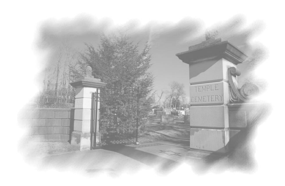
The Temple Congregation Ohabai Sholom Xashville, Tennessee

The Temple's Guide to Jewish Tunerals and Mourning Customs